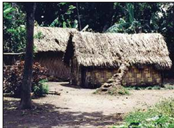
Tanna Island dwelling

The island chiefs ran quickly away, and do you know what? They rounded up all of Missionary John’s things and put them in a heap by the steps to his front door! They said, “Missi! Missi! Come out and see if everything is here!” Of course, Missionary John could not tell if everything was there, but he solemnly looked over the pile and slowly said, “I do not see the lid to my pot here.” And they said, “Oh, that is over on the other side of the island but we have sent a message and it is coming back tomorrow. Don’t worry. It is coming back.” Missionary John said, “Okay,” but they said, “Missi! Missi! Are you going to tell him we stole from you now because we will never do it ever again!” Missionary John said, “Well, I will not say anything, but you must stay right beside me when I go to meet the great Chief of the ship because if you run away the great Chief will ask me why you are running away and then I will have to tell him it is because you are afraid of him because you stole from me.” The two chiefs said, “Oh, this is great darkness. We are in fear of great darkness, but we will stay right beside you.” And that is just what they did. The chiefs stayed by the missionary as the great Chief came ashore. They talked and tried to become friends. The natives came to the shore with their clubs and as warriors, but they listened, and then the great Chief of the ship took them back to his ship and showed them the